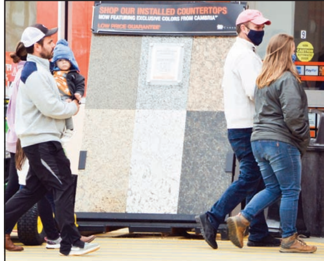
Life goes on in Union County, even amid seemingly never-ending conflict at the national level. Pictured here, people enjoying a trip to Home Depot Saturday.